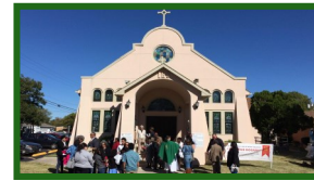
Bulletin printed in-house at: