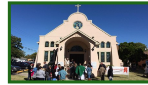
Bulletin printed in-house at: Our Mother of Mercy Catholic Church

1001 E. Terrell Avenue Fort Worth, TX 76104